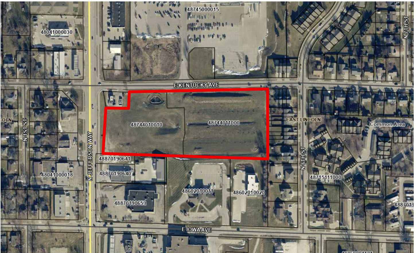
ABOVE: Aerial of subject property (outlined in RED ) in relation to the surrounding area.