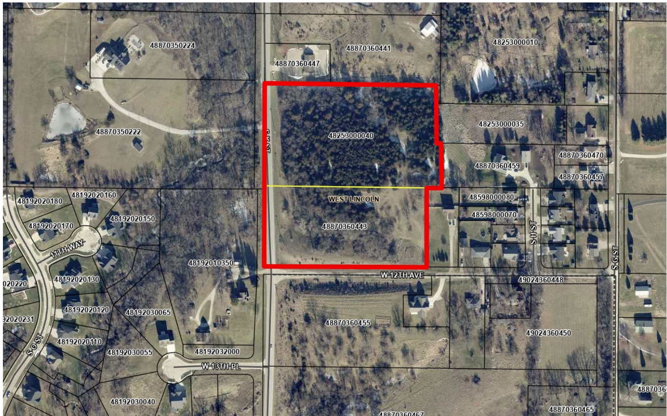
ABOVE: Aerial of subject property (outlined in RED ) in relation to the surrounding area.